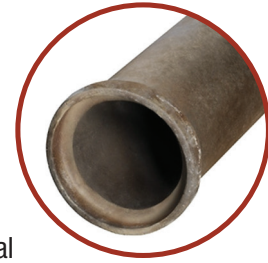
120-year-old pipe recently replaced to upsize the service line.